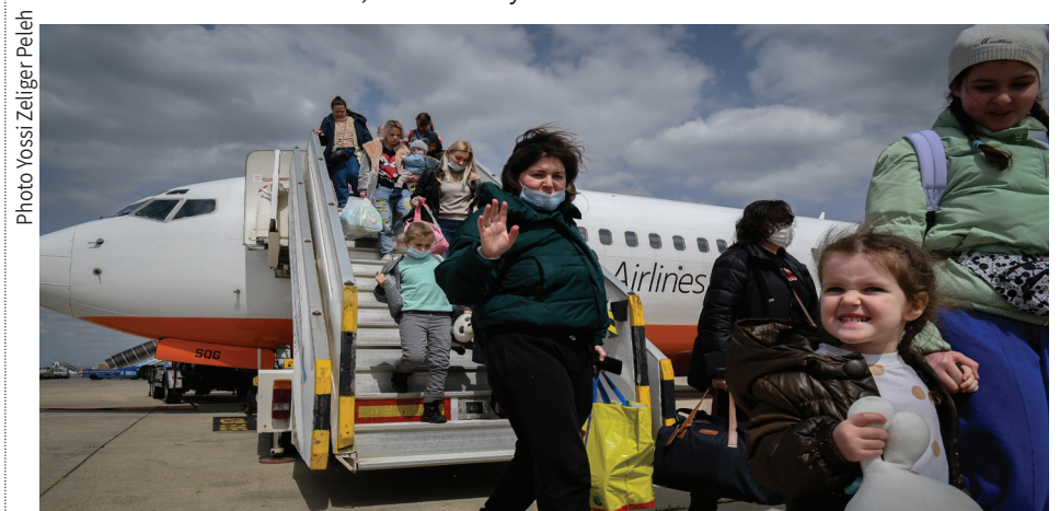
Jewish Olim from Ukraine arrive in Israel